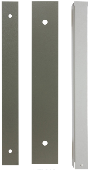
MZO1LPAP MZLPAP 1.002.493